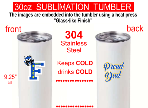
We can personalize this item anyway YOU wish! Don't forget to order some for family and friends.