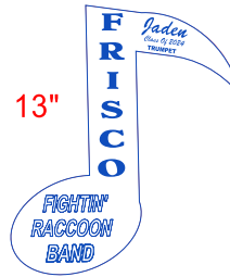
WALL SIGN MADE OF 1/4" PVC MOUNTING STRIPS ON BACK GREAT ITEM TO DECORATE YOUR BEDROOM