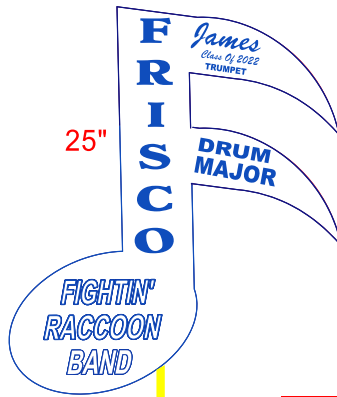
LEADERSHIP YARD SIGN